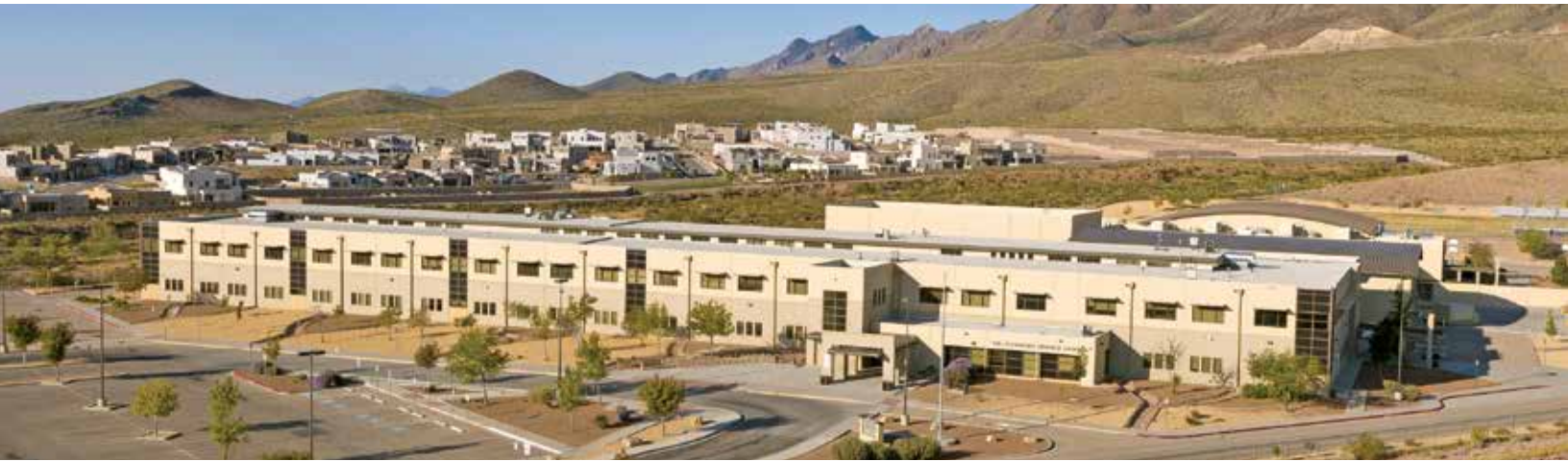
Lundy Elementary School