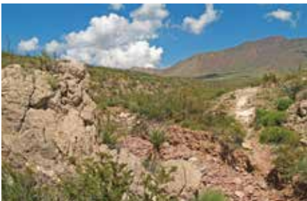
Located at the edge of Franklin Mountains State Park