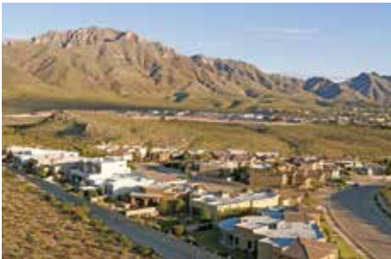
590+ Acres dedicated to beautiful homesites in a mountain environment